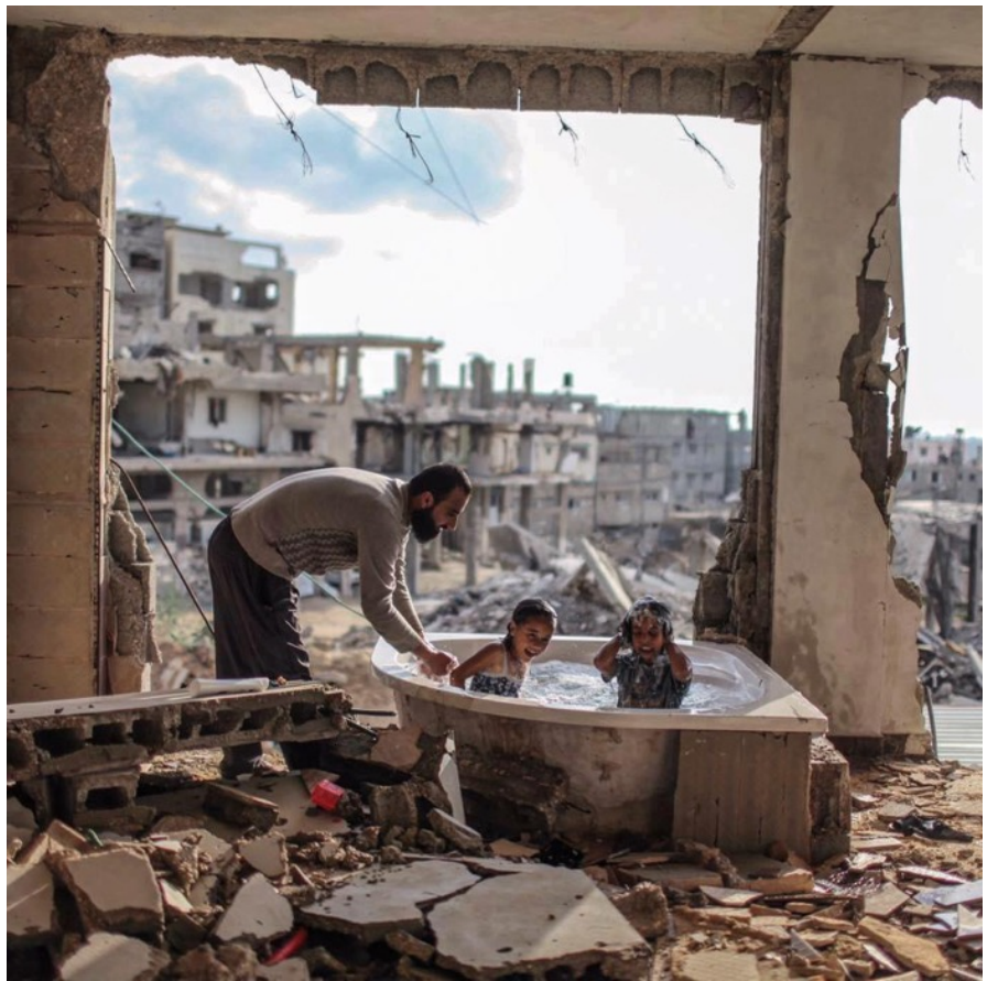
A father cares for his children in a time of conflict - 2016